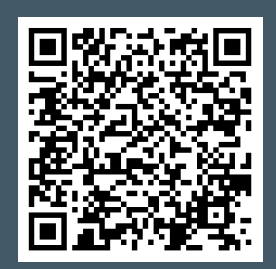
Learn more about DROP

We understand that times are tough, and rising costs in our daily lives make it even more challenging to pay utility bills. In response, the District has launched the Domestic Residential Opportunity Program (DROP). This program utilizes non-rate revenue, to provide financial relief to residential customers. Qualified customers can enroll in DROP and receive a credit on their monthly water bill. Spaces are still available for this fiscal year. For more information on how to apply, visit our website at upudwater.org or call 209-728-3651.